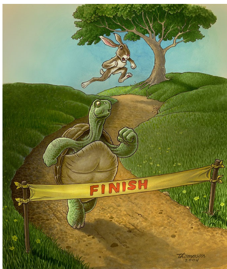
Slow and steady wins the race!

Let's encourage our new colleagues as they enter the PhD marathon!