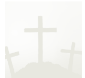
He is risen!